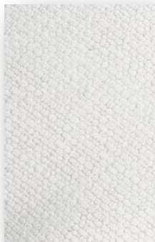
JUMBO 08 PURE