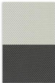
DIAMANTE MOONLIGHT / DIAMANTE METEOR