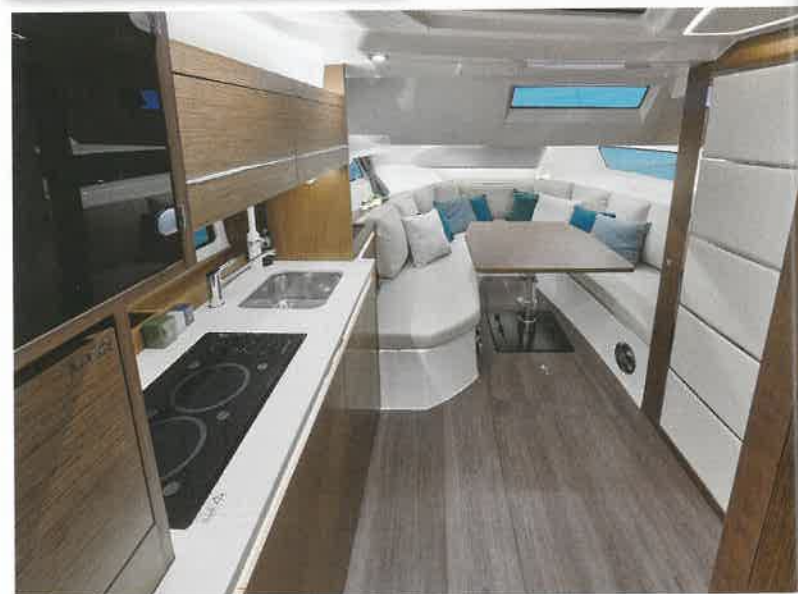
A wide beam and standing headroom between the galley and head make the saloon more than a weekend hideaway.

the forward cabin hints that accommodation sits below the cockpit sole. This under-sole cabin is not only generous in the bed department - a double and a single - but it also has a lot of storage. The forward dinette can, of course, provide extra sleeping space if need be with the table dropped down to provide an infill. There is plenty of headroom around the galley area and in the head/shower compartment - two places where you need to stand properly. Though it has a 60L fridge, the galley is a compact set-up, which with the cockpit wet bar is no hardship. The large head/shower area, like the galley, has teak veneer joinery fitted to a high standard, with the shower/toilet section separated by a glass door.