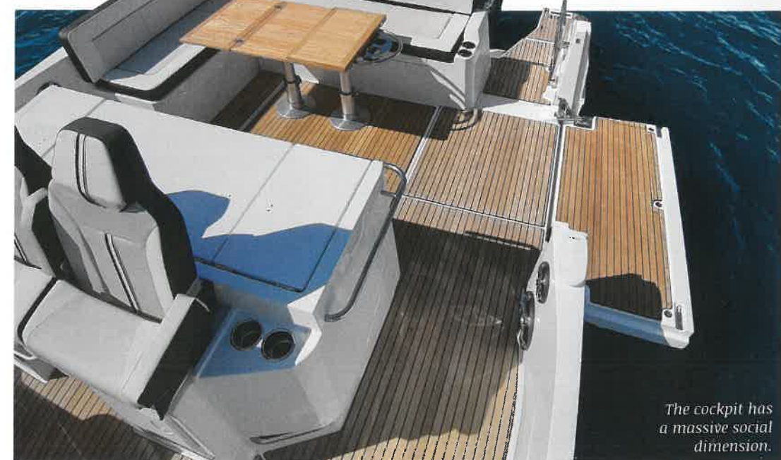
The cockpit has a massive social dimension.

the forward cabin hints that accommodation sits below the cockpit sole. This under-sole cabin is not only generous in the bed department - a double and a single - but it also has a lot of storage. The forward dinette can, of course, provide extra sleeping space if need be with the table dropped down to provide an infill. There is plenty of headroom around the galley area and in the head/shower compartment - two places where you need to stand properly. Though it has a 60L fridge, the galley is a compact set-up, which with the cockpit wet bar is no hardship. The large head/shower area, like the galley, has teak veneer joinery fitted to a high standard, with the shower/toilet section separated by a glass door.